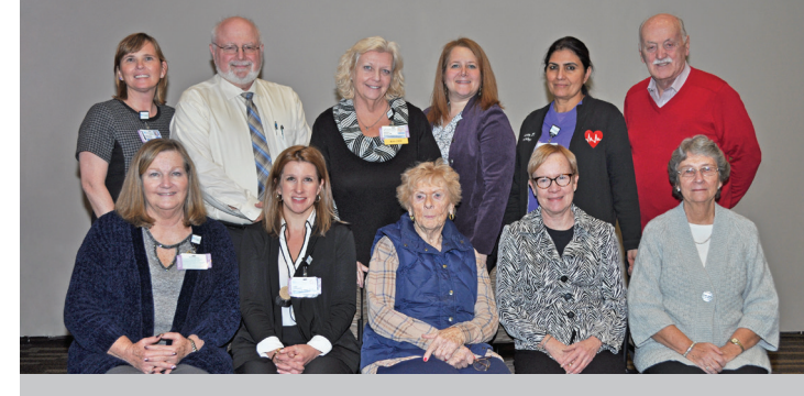
Patient & Family Advisory Council